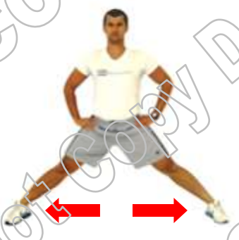
GROIN & ADDUCTORS