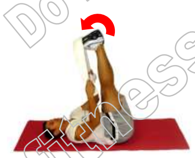
CALVES, HAMSTRINGS & LOW BACK