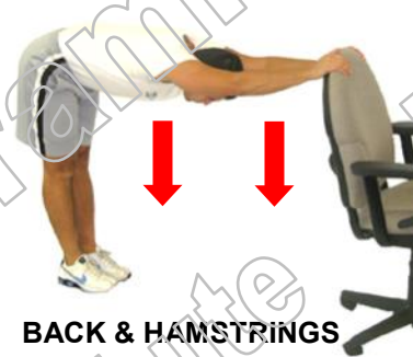
BACK & HAMSTRINGS