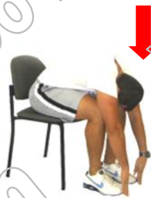
GLUTES & LOW BACK