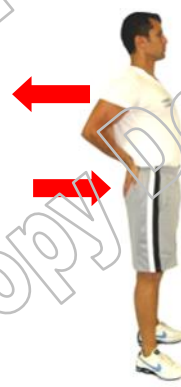
SHOULDERS & CHEST