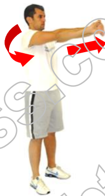
SHOULDERS & UPPER BACK