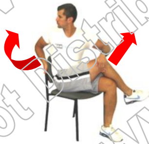
GLUTES & ABDUCTORS