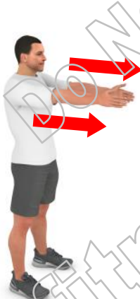
SHOULDERS & UPPER BACK