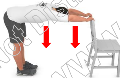
BACK & LATS