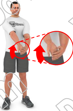
BICEPS & FOREARMS