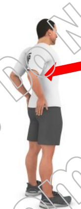
SHOULDERS & CHEST