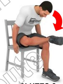
GLUTES & ABDUCTORS