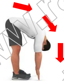
HAMSTRINGS & LOW BACK