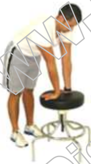
BICEPS & FOREARMS