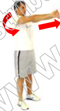
SHOULDERS & RHOMBOIDS