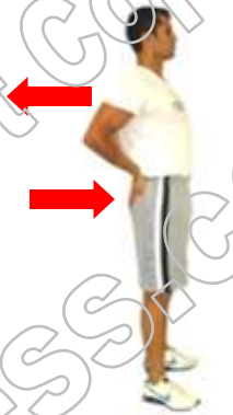
SHOULDERS & CHEST