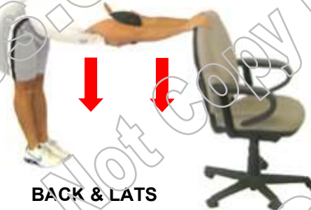
BACK & LATS