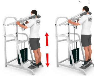
Calf Raise Machine