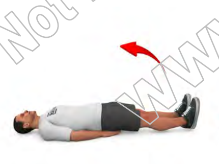
25 Leg Raises