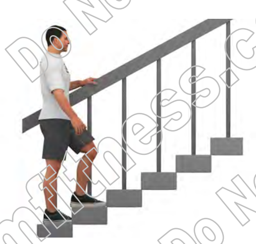
1 Flight of Stairs