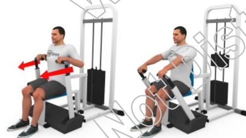
Seated Chest Press