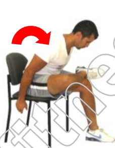
GLUTEAL & ABDUCTORS