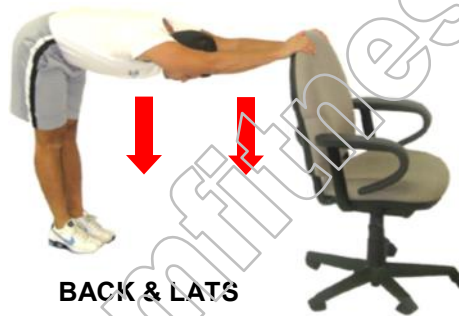
BACK & LATS