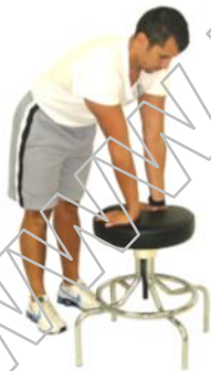
BICEPS & FOREARMS