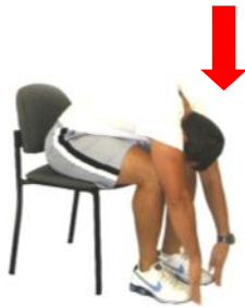
GLUTEAL & LOW BACK