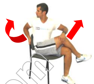
GLUTEAL & ABDUCTORS