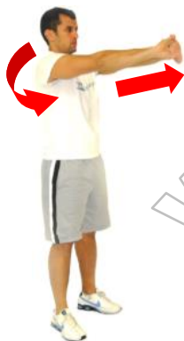
SHOULDERS & RHOMBOIDS